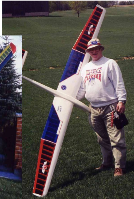
▲ ProRunner 118" $180